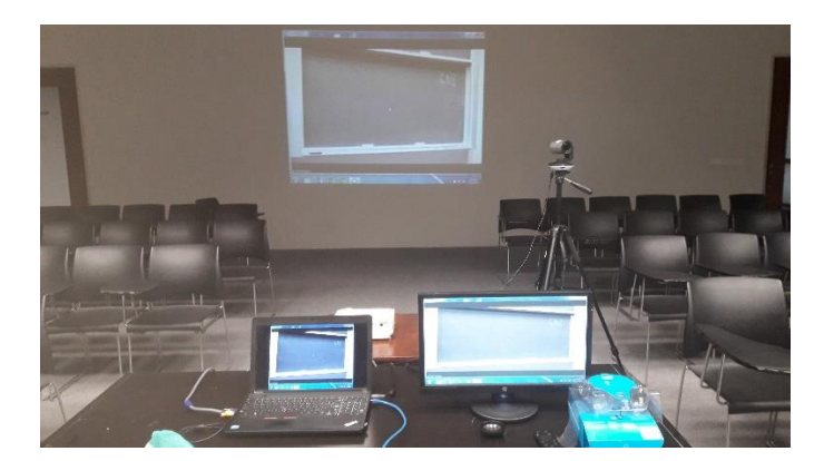
Fig. 1: A view of the virtual classroom.