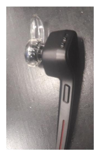
Fig. 4: Bluetooth mic.