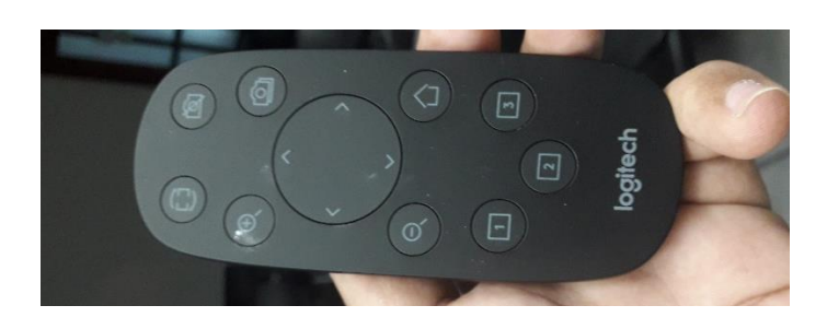
Fig. 2: Remote control of the camera.